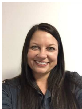
October 4-7, 2018

I can't believe how fast the time just flew by!!! It was such an honor and a huge blessing to serve as the lay director for Walk #67!! I cannot thank everyone enough for making this walk possible!! I was just one little soldier in a huge army - an army of God's love!!! Thank you to each one of you that participated in any way: the conference room team, the outside servant team, making agape, attending the weekend services, the sponsors, the pilgrims, and all the prayer warriors!! Walk #67 had been bathed in prayer for months, and we felt those prayers!!! The light of Christ was shining bright throughout the entire weekend!!! And it really was THE BEST WALK EVER!!!! My heart is so full and I will forever be grateful!!!